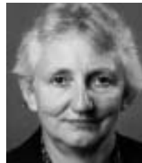
Baroness O'Neill of Bengarve Principal of Newnham College, Cambridge