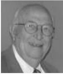
Mr William H Gates Sr Co-Chair of the Bill & Melinda Gates Foundation