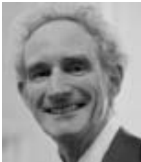
Baron May of Oxford President of the Royal Society and Fellow of Merton College, Oxford