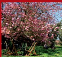
Front cover: Grantchester in the Spring, April 2007