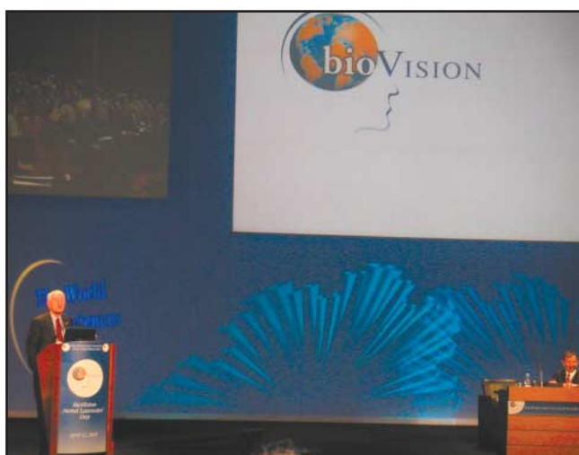
Australian Immunologist, Professor Peter Doherty, Winner of the Nobel Prize for Physiology and Medicine in 1996, speaking at the Nobel Laureates' day during BioVision 2005

I would like to end this article on the following note. Although our PhDs can be extremely stressful and perhaps depressing at times (which were the early days for me), it is often helpful to put things in perspective, which is what this conference did for me. There are millions of people way worse off than us, so at the end of the day, a failed experiment isn't such a big deal, is it?