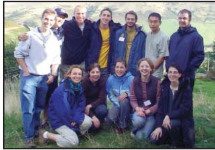
A group of new and returning Gates Scholars in the Peak District

Once we arrived at the Peak District, everyone seemed to be equally as fascinated with the beauty of nature at its finest. The hills, animals, and the purity of the rural setting captivated us all. However, we soon found out how deceptive the steepness of the hills was as we began the orienteering activity. It was a workout to say the least. The other activities and team building exercises were amazing. Personally, I have always wanted to do something of this nature, but I never had the opportunity before the orientation trip.