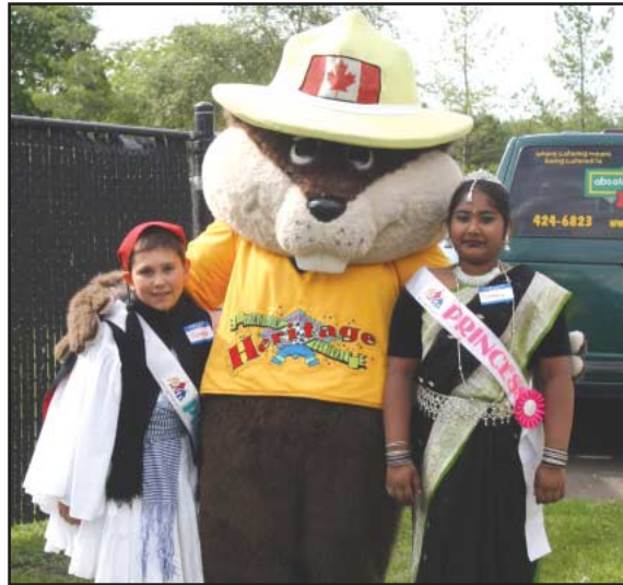
Buddy Beaver with his multicultural friends at the Edmonton Heritage Festival

Canada's government has adopted policies of multiculturalism and official bilingualism, attempting to preserve a "cultural mosaic" of separate ethnic groups coexisting in a society. As a Chinese Canadian living in Edmonton, the capital of the province of Alberta and home to more than a million people belonging to over 50 cultures,