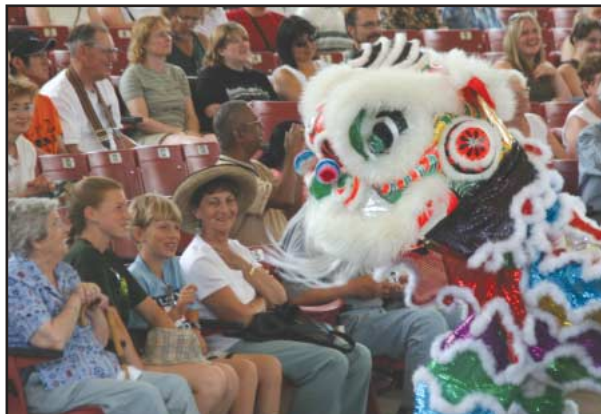
The Chinese Lion introduces itself to the Cultural Show's audience members

Many groups consisted of young people; second generation Canadians and some who had come to Canada as babies and toddlers many years ago. Most only spoke English and had to learn the language of their origins to sing songs to the audience of "Canadians" of all stripes and