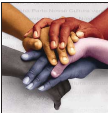
Multiculturalism and its diverse colours

In the Gates Scholars community, we are ideally situated to discuss a raft of contentious issues. The best we can do is be interested. After all, we live here and we support the ideals of freedom, equality, and respect. Can we afford to turn a blind eye? What kind of world do we want for ourselves? What kind of world do we want for our children? Perhaps it is the right time to consider these questions.