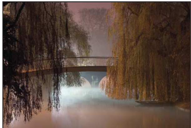
Through the willows