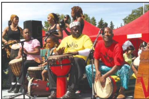
A lively band from Barbados performing at the Edmonton Heritage Festival

colours. Despite mistakes and the pronunciation sounding different from perhaps what it ought to be, their parents looked on with pride. Some groups even taught the multi-coloured audience to sing along. Despite who we were or where we came from, we soon found ourselves laughing and singing enthusiastically in broken German, Dutch, or Vietnamese.