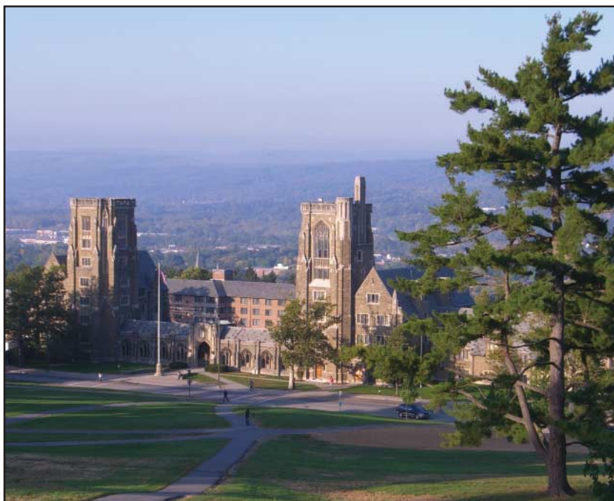
Cornell University, Ithaca, NY.

When I first came to Cambridge as an undergraduate in 1998, neither I nor my parents, uncertain whether they wanted their daughter to attend university in a different country, a long way away, would have expected I would stay for seven years. When my time as an undergraduate came to an end and I began applying for graduate study and funding, I would never have thought that the generosity of a single man would enable me to do not only my MPhil, but also my PhD. (I can still remember that moment in 2001 when I received the e-mail from the