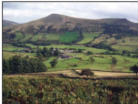
The first instalment of Orientation 2005 took place in the picturesque Peak District

As most of us had only arrived in Cambridge one or two days before, some of the poor overseas people were still suffering from jetlag, but were not shown any mercy. We were sent out directly to engage in an orienteering exercise, which also posed a problem in terms of remembering the names, colleges