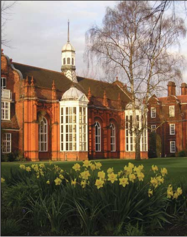
University of Cambridge, Newnham College

Of course I was abstractly aware of both of these possibilities. Yet now – even though I cannot credit myself with the latter (yet!) – at least the former has become an actuality for me. Having studied the exceptions to language systems for so long, the actual systems have by now become deeply familiar to me. When I teach a language, I