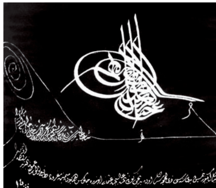
Image of an Arabic script

Overall, I believe it is important to go beyond simple side-by-side comparison and to study how the empires shaped each other, through trade, diplomacy, and especially warfare. In particular, I am examining the ways in which conflict served, perhaps counter intuitively, as a means of cultural interaction.